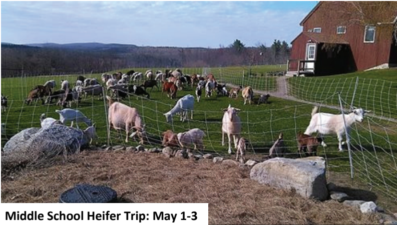
Middle School Heifer Trip: May 1-3