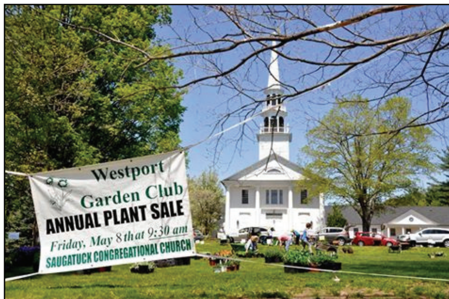
Annual Plant Sale on the Church Lawn by the Westport Garden Club.

Come and join the Women's Spirituality Group: 2nd and 4th Sunday evenings 5-6:30pm, in the Fellowship Room.