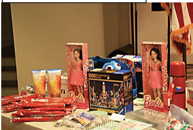
Prizes for Winning at Bingo

Delicious Food Lasagne Pasta Casseroles Chicken Baked Beans Salad, Rolls & Cookie